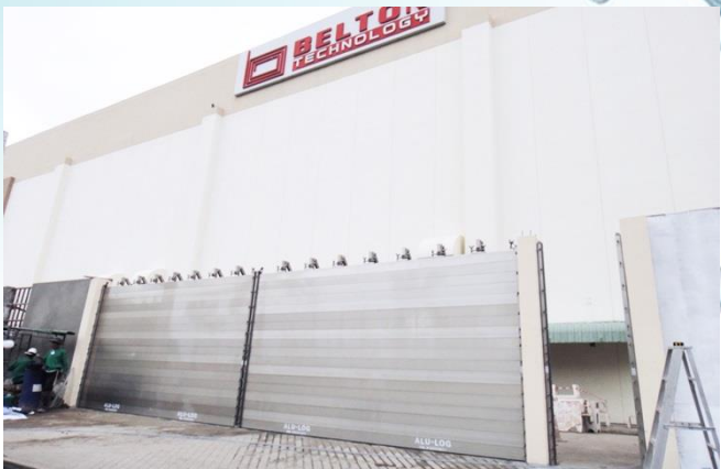
Belton Industry (Thailand) Co.,Ltd.