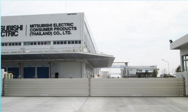
Mitsubishi Electric Consumer Products (Thailand) Co.,Ltd.