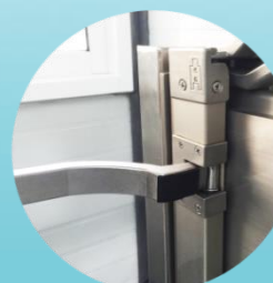
LOCK HANDLE ALU-02 (VERTICAL COMPRESSION)