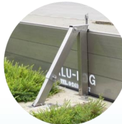
BACK SUPPORT (BRACING)