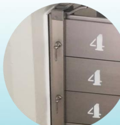
LOCK HANDLE ALU-01 (VERTICAL COMPRESSION)