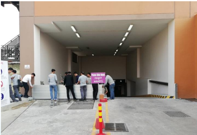
Crowne Plaza Vientiane (Laos)