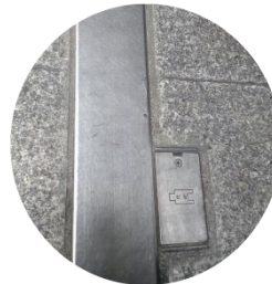
S/S HORIZONTAL BASE