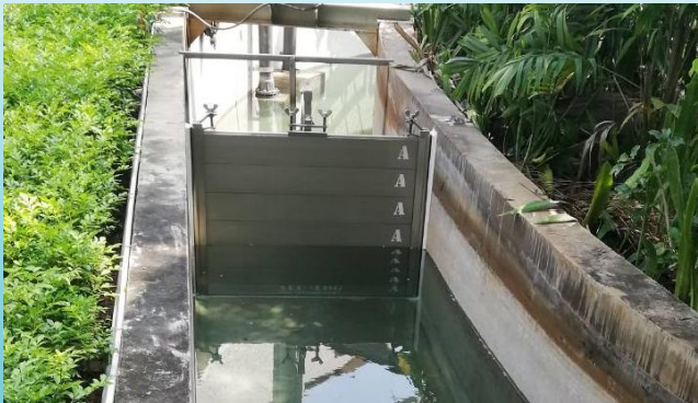
Dream World (Pathum Thani)