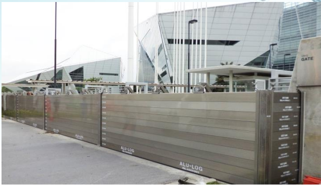
Bangkok University (Rangsit)