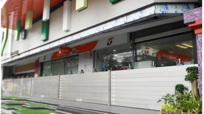
Diana Complex Shopping Center (Hat Yai)