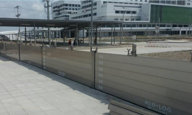
STOP LOG ALU-01