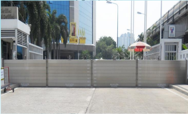
Bangkok Mass Transit System Public Co.,Ltd. (BTS)