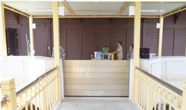
Faculty of Medicine Siriraj Hospital