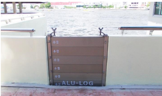
Thammasat University ,Thaprachan Campus