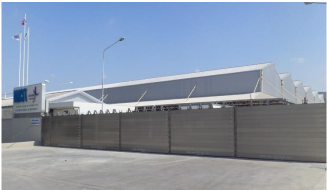
TC Manufacturing and Assembly (Thailand) Co.,Ltd.