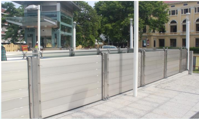
MRT Blue Line – Sanam Chai Station