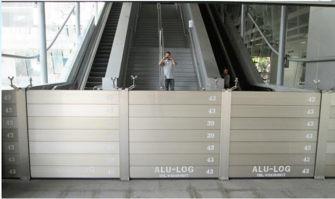
MRT Purple Line – Bang Yai Station to Bang Sue Station