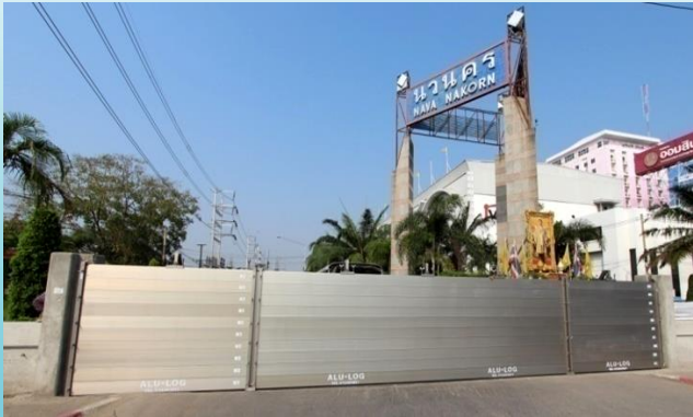
Navanakhorn Industrial Estate, Main Gate