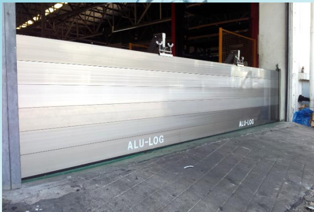
Jinpao Precision Industry Co.,Ltd.