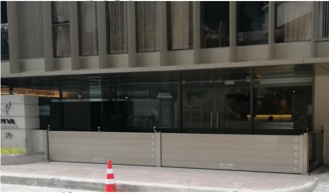
Piya Residence Sukhumvit 28 & 30