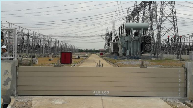
Electricity Generating Authority of Thailand (Sai Noi Station)