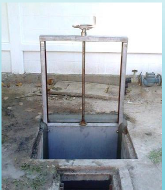
Thai Matto NS Co.,Ltd.