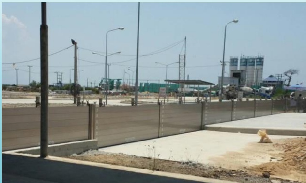
Chakri Naruebodindra Medical Institute