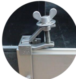
CLAMP LOCK (HORIZONTAL COMPRESSION)