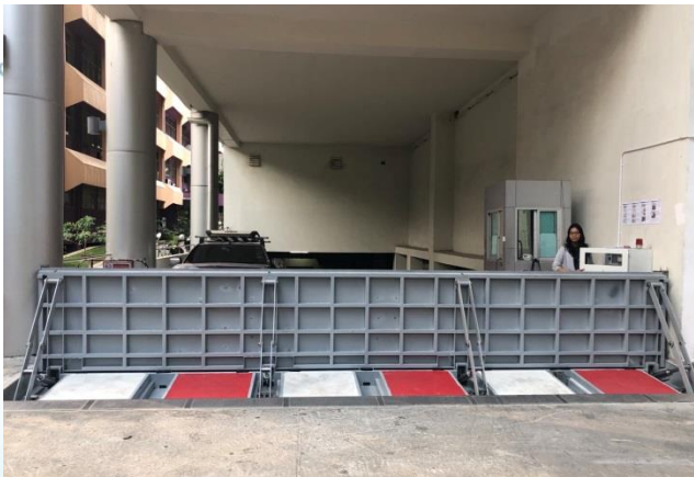
National Innovation Agency (NIA)