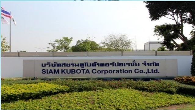
Siam Kubota Corporation Co.,Ltd.