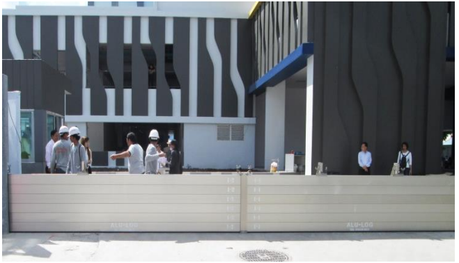
Silk Place (ซิลค์ เพลส)